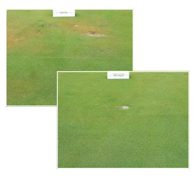
Improved air and water balance with Cascade Plus and Duplex 4+1 combo (right) and untreated control (left).